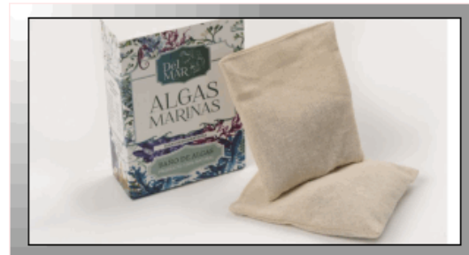
Seaweed bath salt