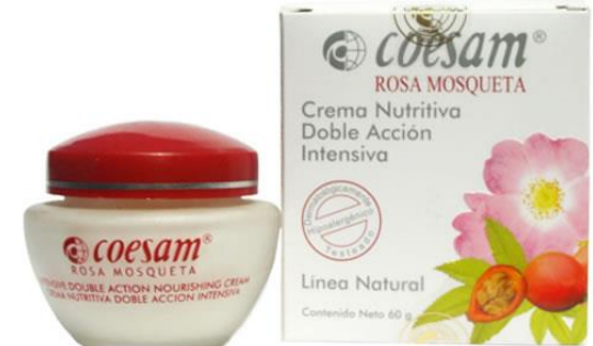
Rosa Mosqueta nutritive cream