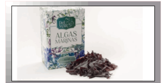
Seaweed bath salt