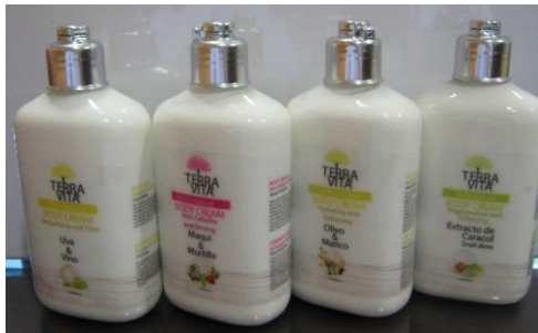
Maqui and Murtilla Anti cellulitis cream

Natural cosmetics based on maqui, murtilla, olives, grape, snail slime, among others.