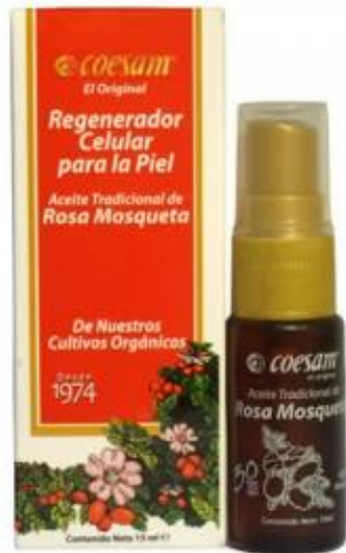
Rosa Mosqueta cellular regenerating cream

Organic body cream firm. Its products are based on Rosa Mosqueta, certified by IMO-Switzerland. It also produces derivatives from grape and snail slime.