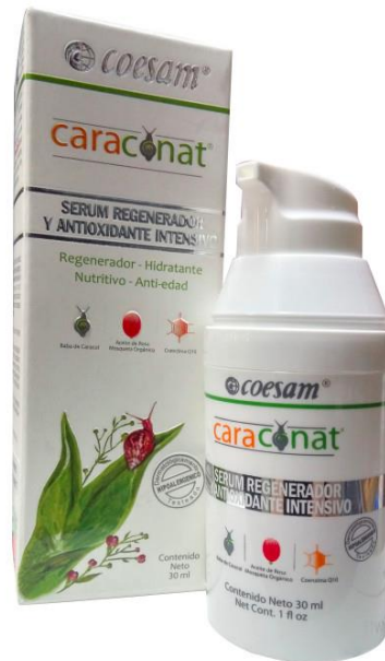
Snail slime antiox cream