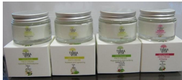
Anti aging cream