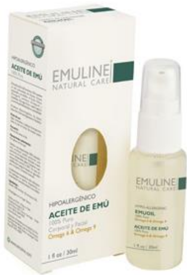
Emú Oil It repairs regenerates skin tissue.

It produces more than 40 products, including regenerating skin creams and baby body creams, among others.